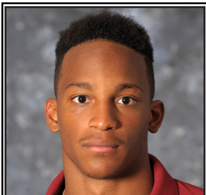
Offensive Student-Athlete of the Week (Nov. 2)